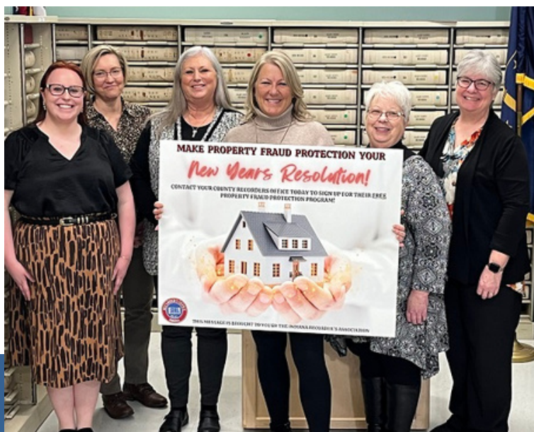
(Left) Group shot at the NE press conference