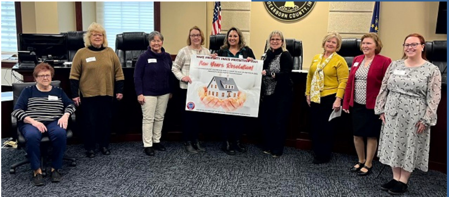
Group shot at SE press conference in Dearborn County. The theme of the campaign was "Make Property Fraud Protection your New Year's Resolution."

Thank you to each of the Recorders who hosted a press conference.