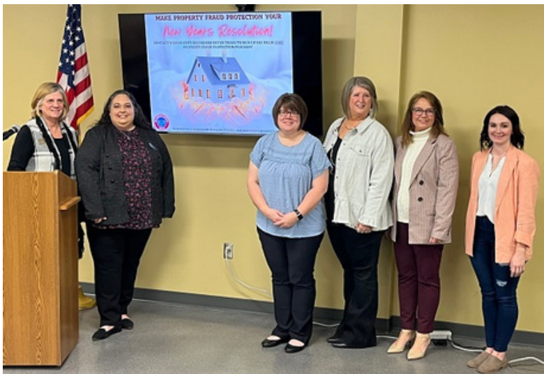
Group shot, NW press conference, Lafayette market.