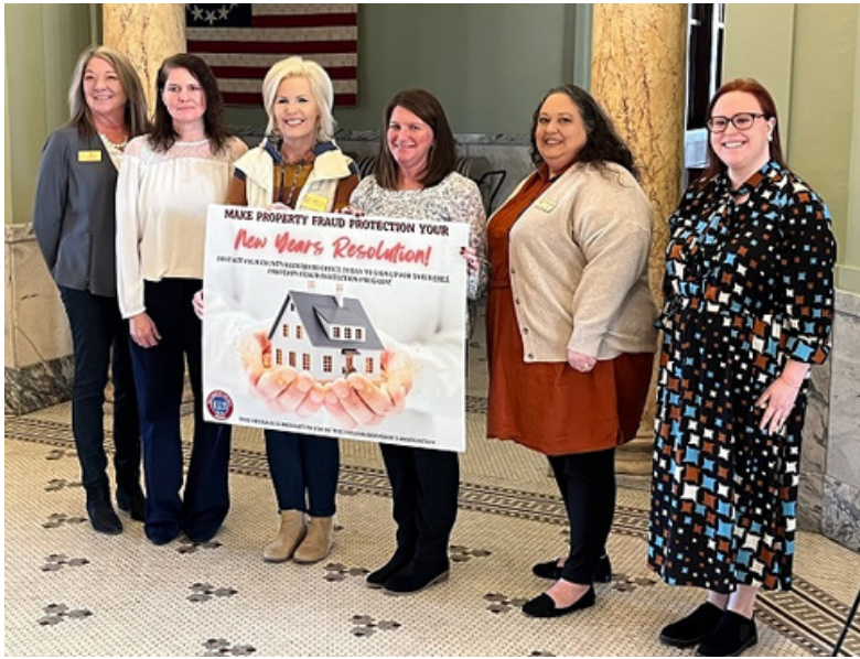
Group shot, WC press conference, Terre Haute market.