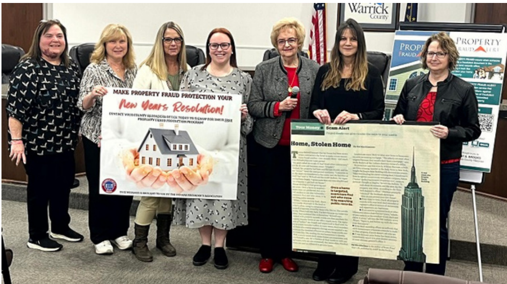
(Pictured to the left) Group shot at the SW press conference in Warrick County.