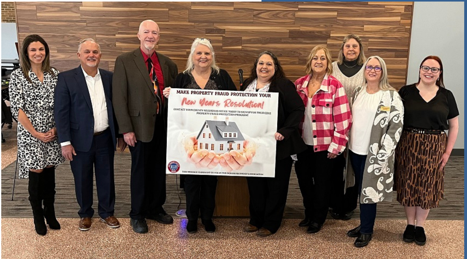
Group shot at the NW press conference.

Thank you to each of the Recorders who hosted a press conference.